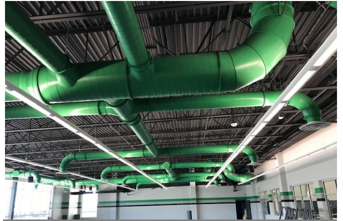
Burnet Student Activity Center